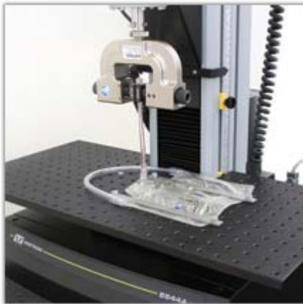
Tapped test plate mounted on a single column testing system

The Instron Component Test Plate is designed to accommodate the trend of testing end products or components. Within the medical device industry, many test requirements focus on the actual quality and test performance of the end product in addition to the standard test requirements of the materials from which it is constructed. The Component Test Plate is used to determine the force limits, in particular functional elements, of products ranging from catheter delivery systems to buttons on diagnostic test instruments. Once oriented, the test component can be easily fixed to the base through the array of tapped holes. A force applicator (probe, hook, or clamp) can then be attached to the load cell. The combination of a fixed component and test force applicator generates valuable results for either quality or research and development groups. Additionally, the Component Test Plate simplifies the process of adapting custom-made grips and fixtures to the testing systems.