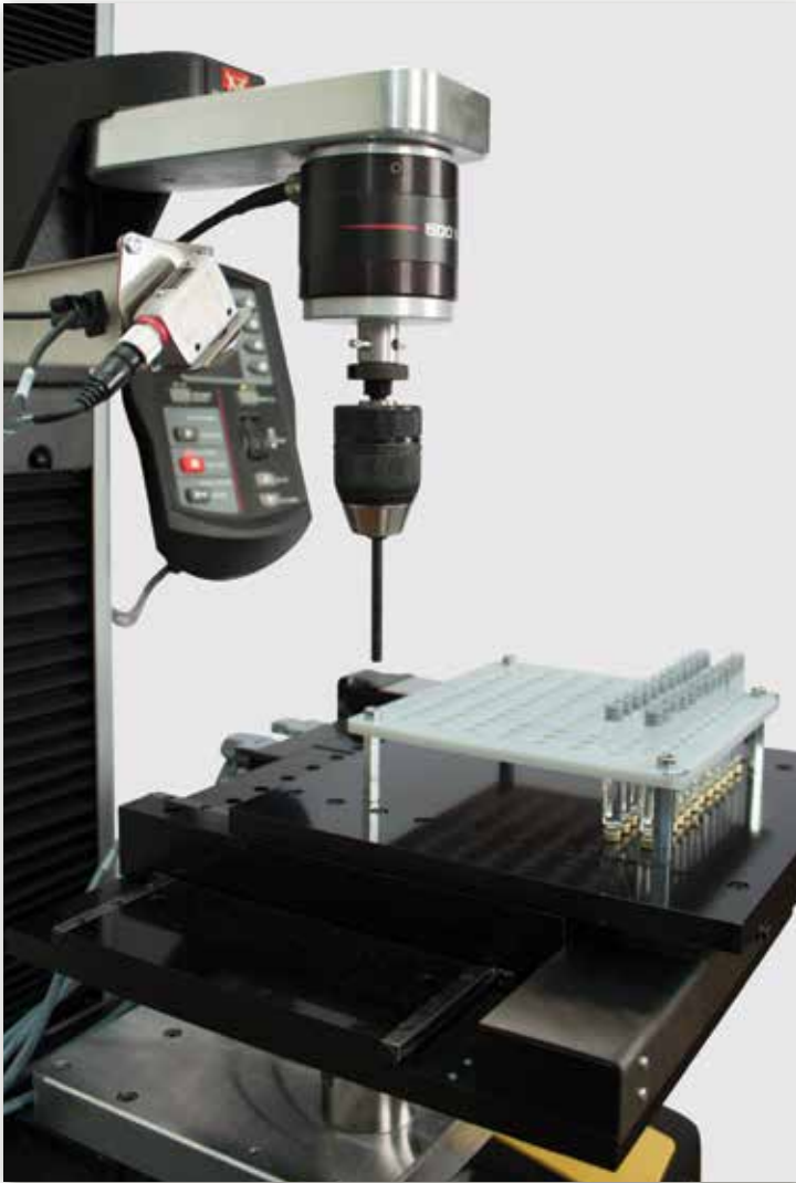
Unattended Tests Performed Automatically on up to 96 Glass Vials

Ensuring a safe and comfortable workplace is fundamental to an organization. Automated testing alleviates potential pinch points or safety hazards for operators using testing equipment. By removing the strain of bending and the repetitive motion of loading specimens, the operator can load dozens of specimens to be tested, press "Start", and remain completely clear of the test area.