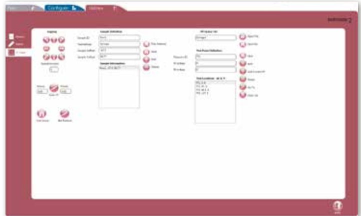
TestMaster User Interface